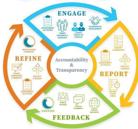
Figure 3. BOEM Stakeholder Communication Approach

Development of the Project within the Lease Area and along the export cable route(s) will occur in several phases including surveys and assessments, design and siting, permitting, construction, operations and maintenance, and decommissioning. The 'adaptive' nature of the FCP will allow it to be updated over time as inputs are received and through different phases of Project development and implementation.